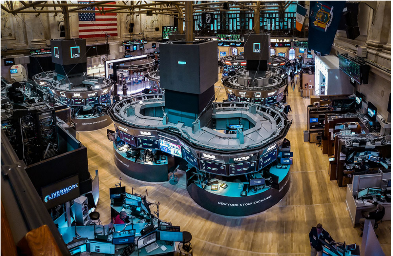
A view of the trading floor at the New York Stock Exchange in 2022

"I don't think it's determinative in terms of the changes of votes," Smith said of the anti-ESG efforts. "It's one factor of half a dozen."