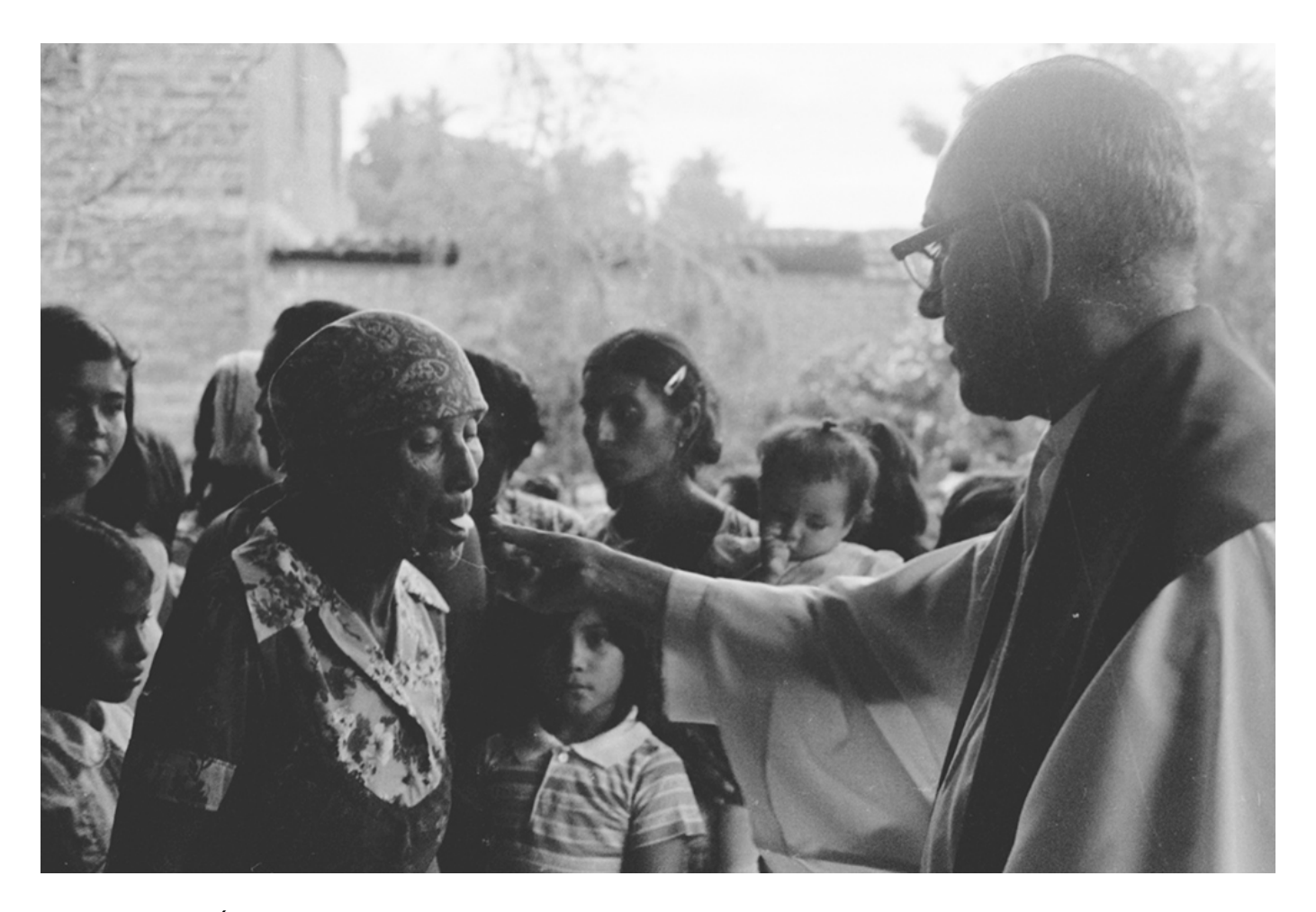
Archbishop Óscar Romero offers Communion to a woman during a confirmation Mass in Ateos, El Salvador, in September 1979.

Like the people of El Salvador, we too are called to bear witness to this inseparable bond between the Eucharist and gospel nonviolence. Nonviolent, suffering love is the living breath, the pledge that unites the Last Supper to the cross. It is the beating heart of the Eucharist.